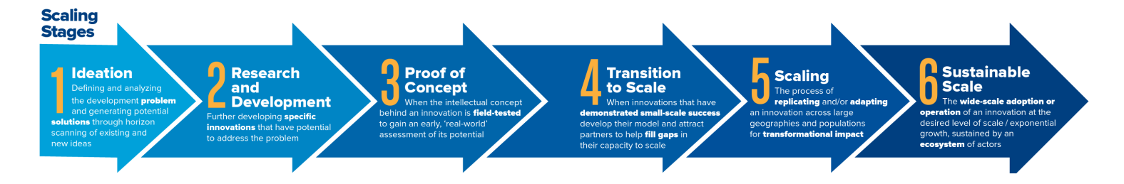
Figure 1. International Development Innovation Alliance's 'Insights on Scaling Innovation Framework'

the entire pathway to scaling from ideation and research and development through sustainable scaling, with milestones defined for each of the scaling stages. Milestones chosen for inclusion were mapped onto a prevailing scaling framework used in the broader global development sector - the International Development Innovation Alliance (IDIA) Innovation Scaling Framework to anchor our work within the current industry understanding about the scaling process (Figure 1) (IDIA, 2017). The IDIA framework was best suited and easily adapted for this project because it provides a delineation of the scaling process from the original idea through scaling and uses standardized terminology that can be recognized across the broader development community (see definitions in Figure 1).