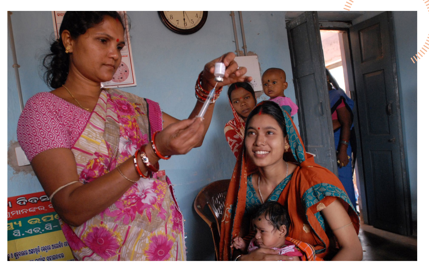
Pippa Ranger/Department for International Development

Lessons learned from providing real-time analysis for COVID-19 global response: a case study about the process of collecting real-time data to inform policy and advocacy on critical issues